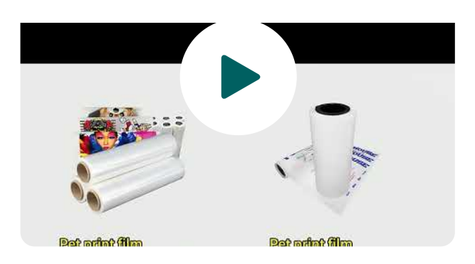
12×18 DTF PET Film